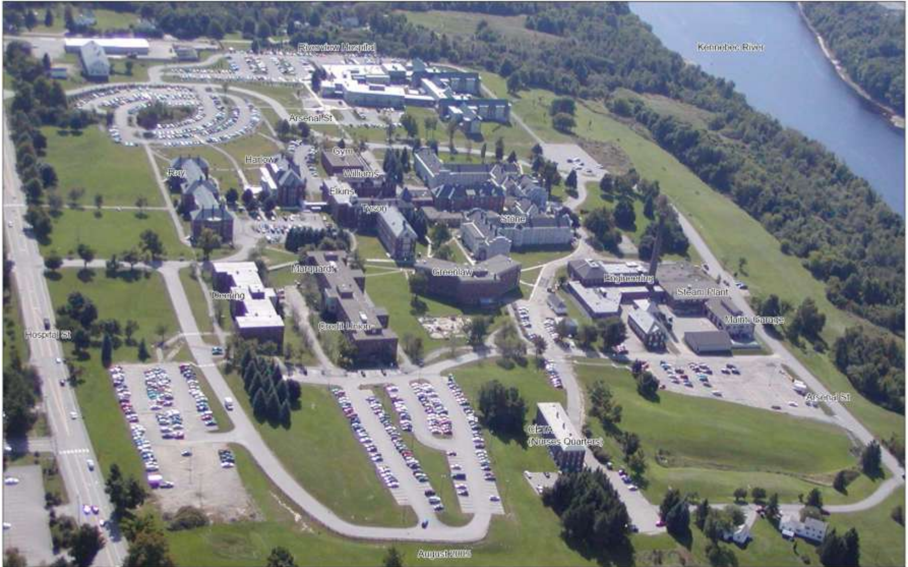
AREAL PHOTO TAKEN BY JAMES REA (BP&P&L)State/Harlow_Photos/campus wor